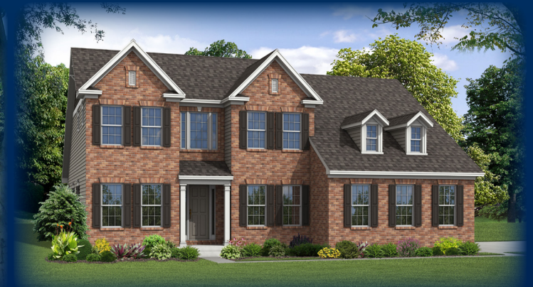
Elevation 5 - Shown with Opt. Brick