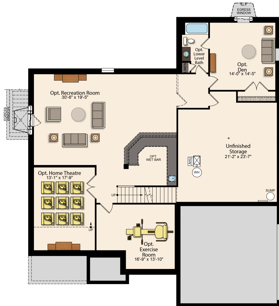
Opt. Finished Lower Level